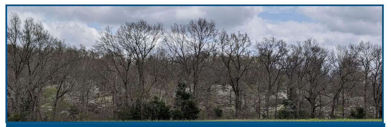
I was treated to a beautiful show of flowering dogwoods this April. This property in Seminole County had the highest density of flowering dogwoods have ever seen. Absolutely stunning!