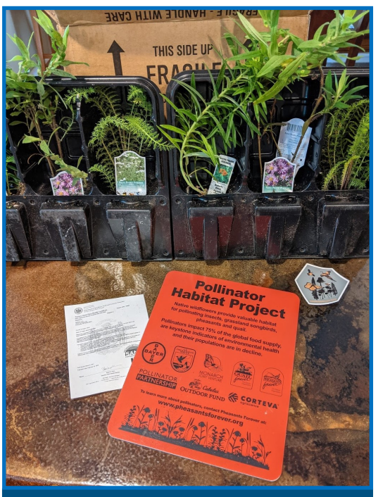
These pollinator kits specifically designed for their planting region are being sold for the price of a membership. Membership included!