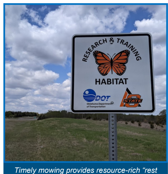
Timely mowing provides resource-rich "rest stops" where butterflies can feed without being pressured to cross the road and search in other areas.