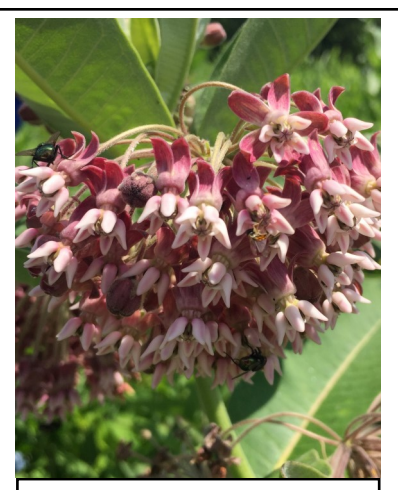
Common Milkweed in June from The Tallgrass Prairie Preserve in Osage County