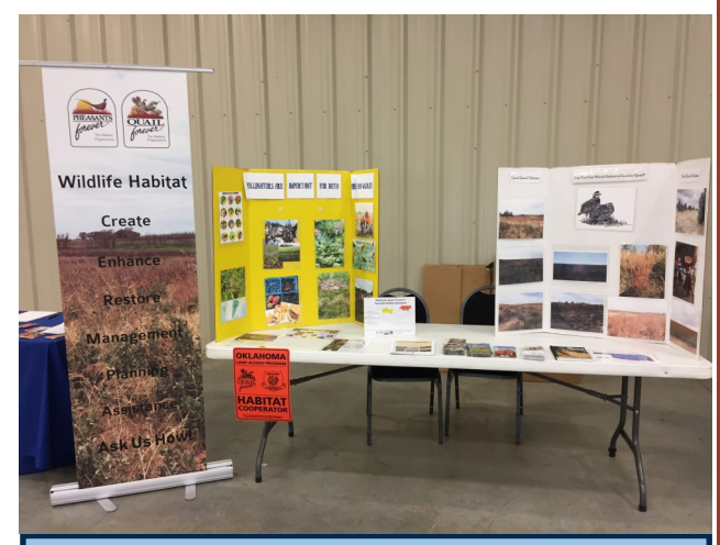
This photo was taken during the Craig and Ottawa Counties Trade Show in April, 2019