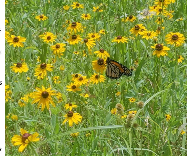
Photo: Observed several female monarchs nectaring exclusively on Black-eyed Susans while conducting monarch habitat evaluations.