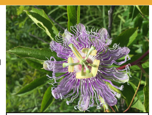
Passion Flower in June Photo from OSU Research Range outside Stillwater, OK

don't know. I love figuring out which forb it is and the benefits they provide to wildlife. I am looking forward to this summer to add to my collection.