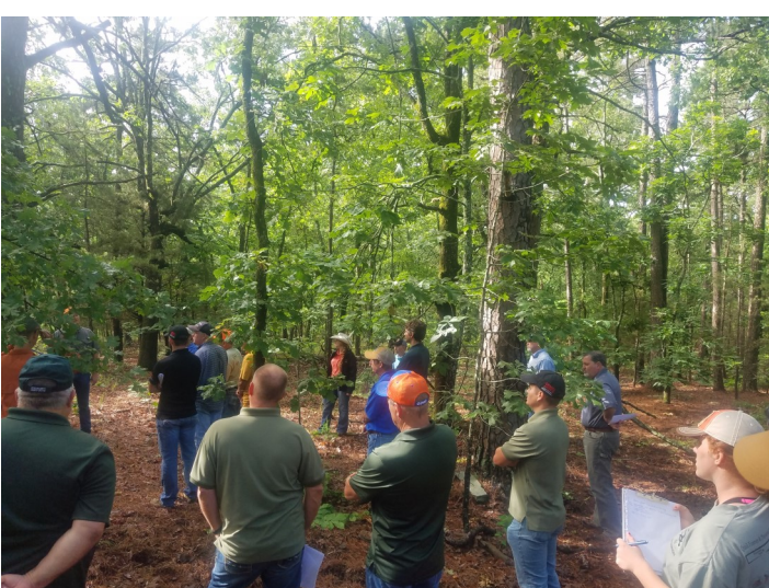
Photo taken during Pushmataha WMA Field Day. This is one of the forest research plots on the WMA showcasing the results from different management techniques. You can walk along a road, lined with research plots, and get a great visual of management results and then implement these management techniques to achieve your personal goals and objectives for your property.