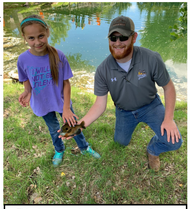
This photo was taken June 7th at the Beaver Field Day. 4H kids gathered for a day filled with pollinator planting, fishing, and other outdoors activities.