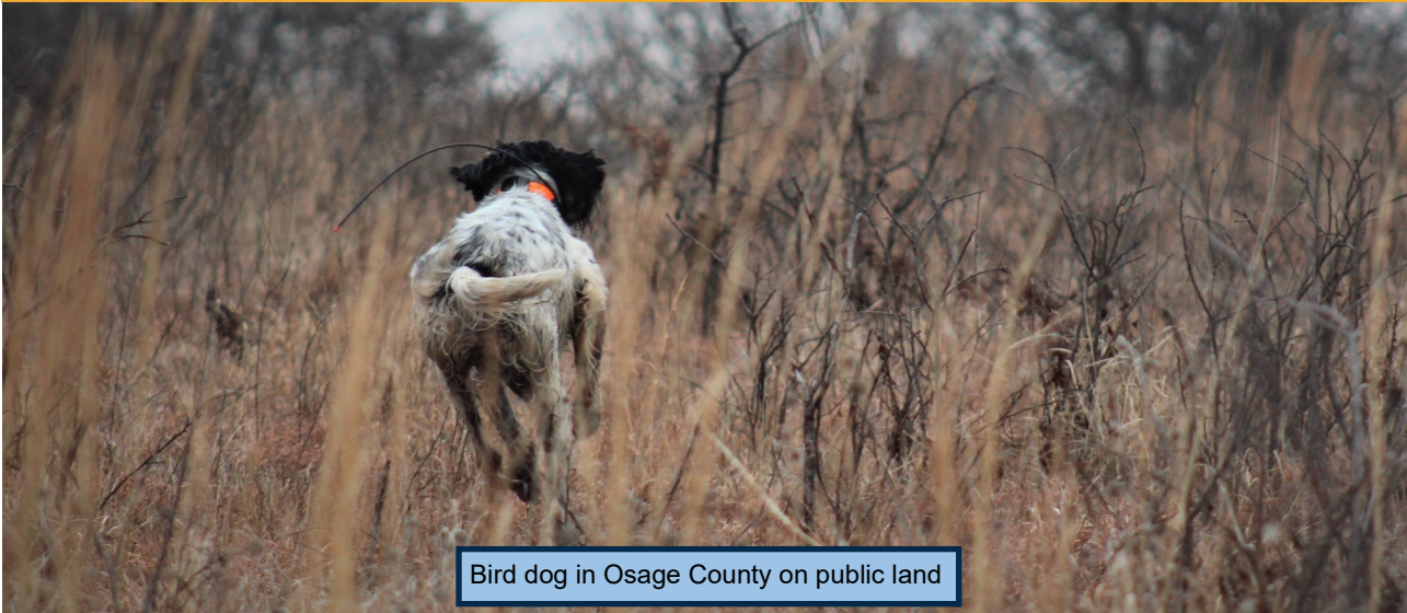
Bird dog in Osage County on public land