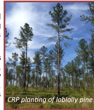
CRP planting of loblolly pine

Since the 1990's my mother, who now manages the property, has continued to expand soil, water, and wildlife conservation practices to cover nearly every acre of our former farm. Pollinator plantings, buffer strips, prescribed fire, and invasive species control help us achieve our objectives.