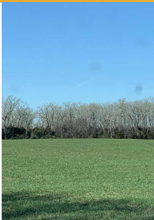
This photo was taken in February, during a site visit looking at brush management through EQIP Monarch to control cedars for turkey habitat improvement.

It was a challenging beginning to the year adjusting to new Covid protocols, meeting deadlines, trying to meet safely with producers, and still executing our goals to positively impact the land. There is a light at the end of this long tunnel. This spring has largely been playing catch-up, with many producers being able/willing to meet safely with their vaccines. There has been a drastic increase in interest in applying prescribed fire out here, for brush management as well as wildfire prevention and overall range health management. There is still much to do, many producers to visit, and impact to be made. The green invasion will never stop, so neither can we!