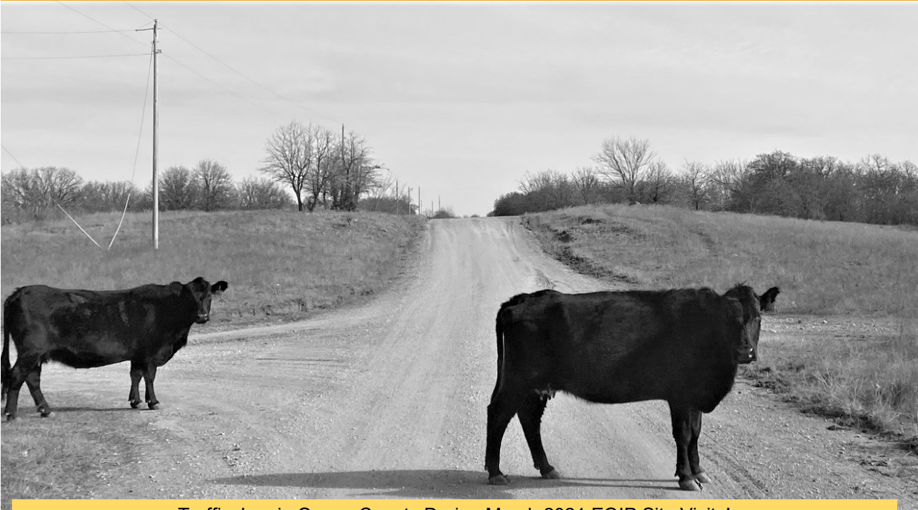
Traffic Jam in Osage County During March 2021 EQIP Site Visits!