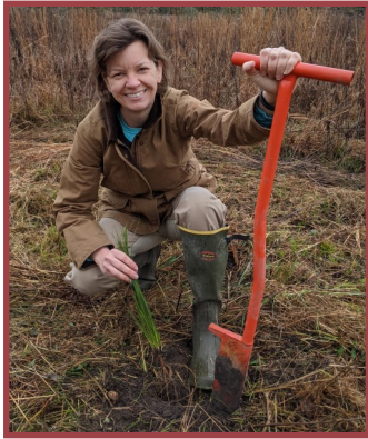
Planting bare-root longleaf pine on my family's property to replace trees lost in the hurricane.

A few months ago, my husband and I made a trip “home” to visit my family and our property. Although nearly 1000 miles away, this south Georgia land is near to my heart. Growing up on this multi-generation farm, I learned about peanut cropping, boll weevils, and long-passed bird dogs with a nose for quail. In my teens, my family and I spent days hand planting loblolly pine seedlings—transitioning about half the property from highly erodible crop fields into Conservation Reserve Program (CRP).