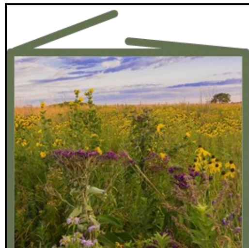
Think Outside the Box! Planting a native seed mix can be a great way to provide habitat for monarchs and pollinators, but it is not always appropriate or the most effective practice. Brush management and prescribed burning can make great habitat.