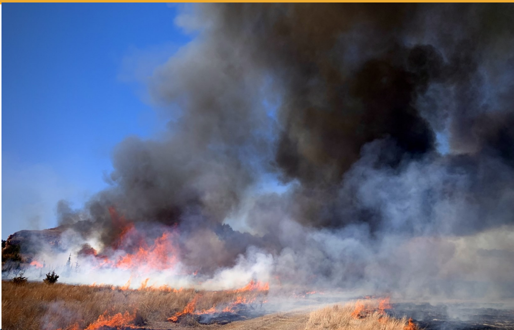
This photo was taken in March during a prescribed burn. This landowner was conducting his first prescribed burn on his property, and myself along with the local prescribed burn association assisted him. The landowner was VERY pleased, and is wanting to conduct more in the near future!