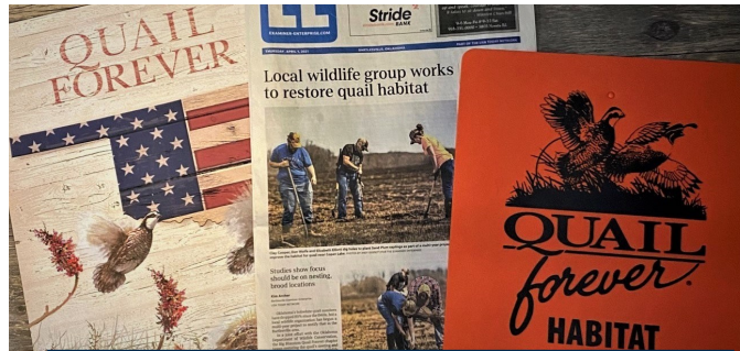
Center Newspaper is the Bartlesville, OK Examiner-Enterprise

On March 27, 2021 volunteers from the Quail Forever Big Bluestem Chapter out of Bartlesville, OK came out to help plant 500 sand plum saplings on Copan Wildlife Management Area in Washington County, OK. This was the first of many habitat work days to come for the chapter over the next few years.