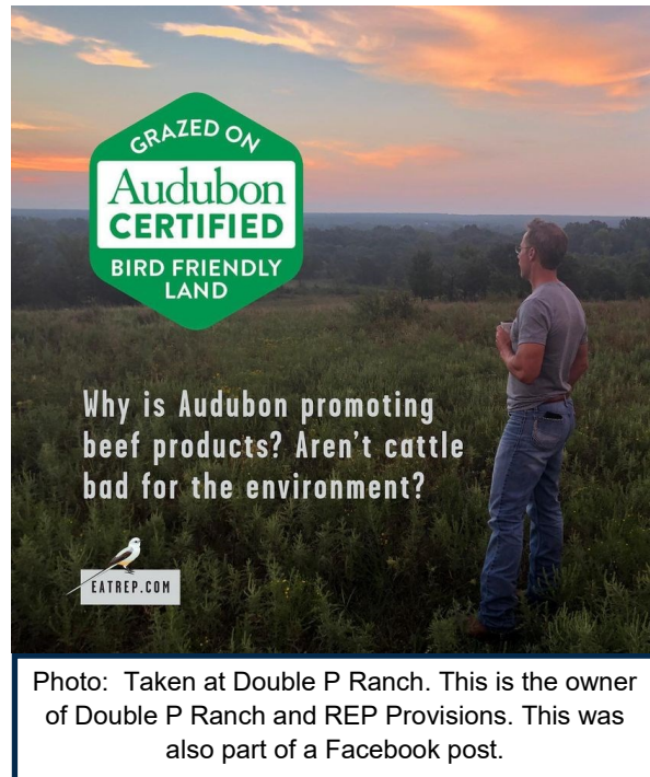
Photo: Taken at Double P Ranch. This is the owner of Double P Ranch and REP Provisions. This was also part of a Facebook post.

In addition, I have completed and submitted the Habitat Management Plan for a ranch in southern OK, which will be the third certified ranch. This ranch is also part of the Grassfed Livestock Alliance (GLA).