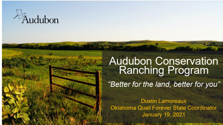
Figure: This was the introduction slide for my ACR presentation to the Tulsa Audubon Society.