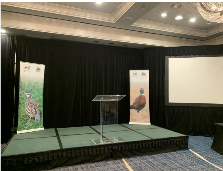
This photo was taken in February at our 2020 State Habitat Convention in OKC, looking at the stage podium for our main speakers.