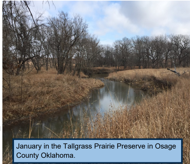
January in the Tallgrass Prairie Preserve in Osage County Oklahoma.

This quarter has been different than any other I have experienced with OK Quail Forever. With everything going on in the world related to COVID-19, I am currently working from home and very thankful for the continued opportunity to positively impact Oklahoma's natural resources. I often have to remind myself that it is important to pause, go outside, see the sun warming the earth and the wonderful colors starting to appear throughout the landscapes.