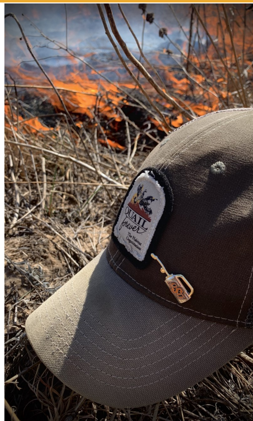
This photo was taken in March, during a prescribed burn that I provided technical assistance at.

Many landowners are wishing to start burning their properties, whether it is for CRP, EQIP, or just wanting a burn plan for CTA. As a result, I have been coordinating with NRCS offices, landowners and PBAs to get plans written and fire on the ground. EQIP applications are pouring in as well, as landowners are desperately wanting to get rid of cedars and bring back grasslands to this part of the state. Taking the necessary extra health precautions during this trying time are critical. However, the work continues as sound conservation practices will be recommended and implemented for quality habitat on the landscape.