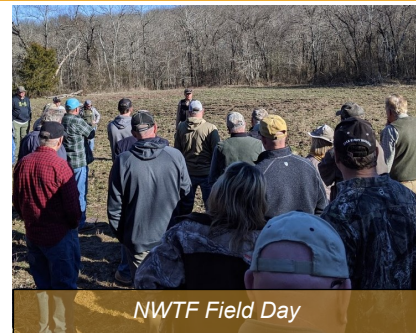
NWTF Field Day