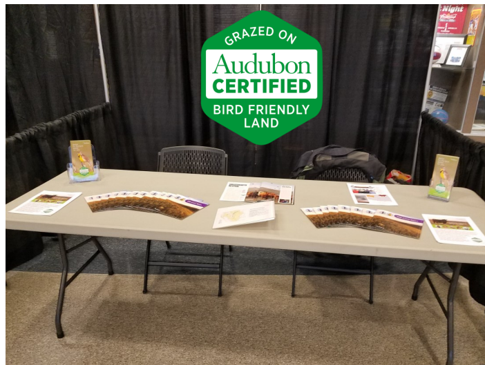
Photo: Audubon Conservation Ranching booth at Oklahoma Grazing Lands Coalition Annual Meeting in Weatherford, OK.