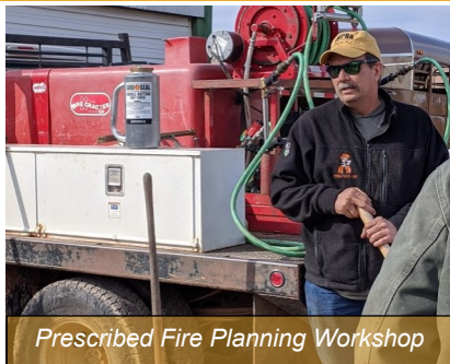
Prescribed Fire Planning Workshop