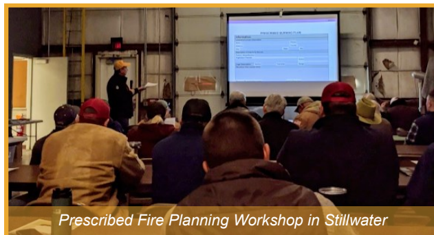
Prescribed Fire Planning Workshop in Stillwater