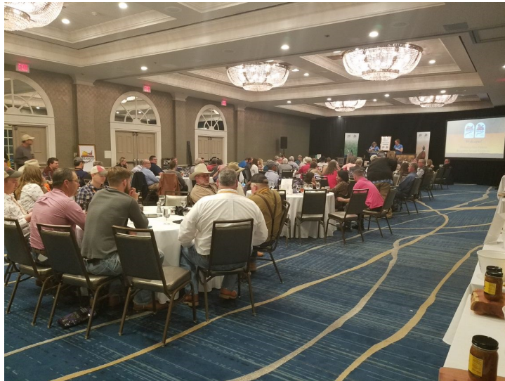
Photo: Taken at the Oklahoma Quail Forever 5th Annual State Meeting in Oklahoma City.

Saturday was the main event at the Renaissance Waterford with a morning general session, lunch keynote speaker, several afternoon breakout sessions, and concluded with a fundraising banquet. What a great event and a big thank you to everyone who attended and assisted.