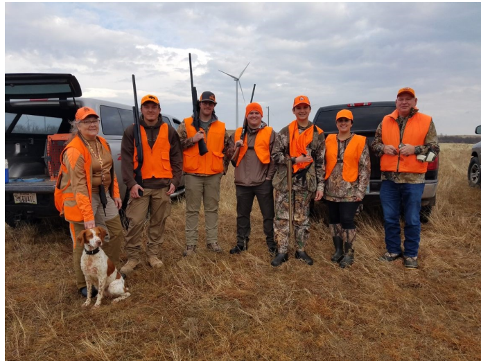
Photo: Taken during Youth Mentor Hunt near Hinton, OK