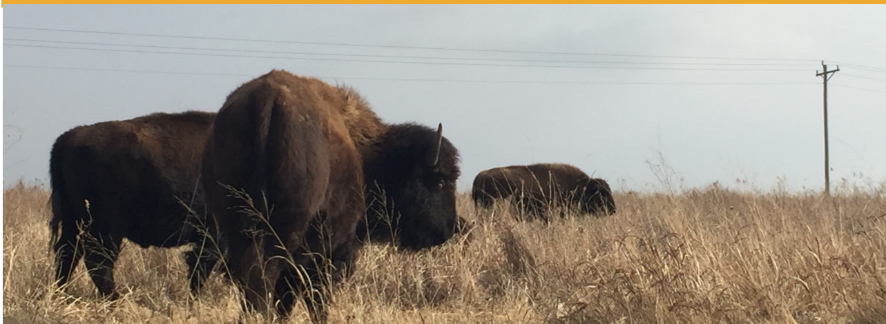
This picture was taken in January 2020 at the Tallgrass Prairie Preserve in Osage, OK