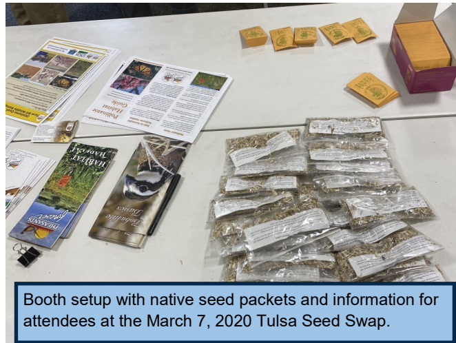
Booth setup with native seed packets and information for attendees at the March 7, 2020 Tulsa Seed Swap.