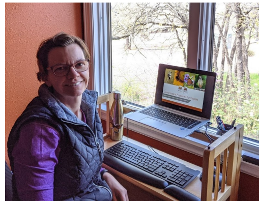
Teleworking to promote the 2020 RCPP for Monarch Butterflies

Now under the COVID-19 quarantine, all meetings have been canceled or converted to virtual meetings. Although, at first blush, this appears to be less-than-ideal, I am hopeful that by presenting the Monarch RCPP remotely, I will be able to more broadly share the message of monarch conservation and how it can benefit quail.