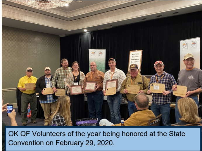
OK QF Volunteers of the year being honored at the State Convention on February 29, 2020.