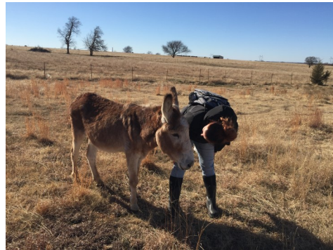
"Making new friends" Photo was taken in Jan 19' during a CTA pasture and range inventory.

Where have the last three months gone? I blinked and it's Spring; the sun is out and the days are getting longer. I've been especially fortunate to spend time training with the best, and now, I get to venture out on my own. I have completed Prescribed Burn Plans, Range Health Assessments and Grazing Plans. This March I had the opportunity to participate on my first prescribed burn. The burn was conducted to help control broomsedge bluestem in a rangeland site. In the morning I helped use the torch for the back fire and then strip head fires. In the afternoon I was on cleanup crew manning the flapper. This was a great learning experience working with the landowner and the team to conduct a safe burn.