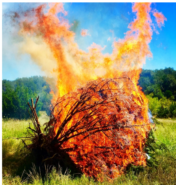
This photo was taken in July '18 of a Dead Cedar burning prior to a Prescribed Burn during the growing season.

Whether it is to get rid of cedars, control undesirables and invasives, setback encroaching vegetation, prepare in the event of another wildfire, better grazing production or quality wildlife habitat landowners are eager to get fire and habitat management on the ground. I will be working right alongside these great individuals, to ensure they get the desired product, as well as the best desired outcome for their property. I will be assisting with various aspects of prescribed fire throughout the rest of the growing season as landowners are learning the benefits of growing season burns.