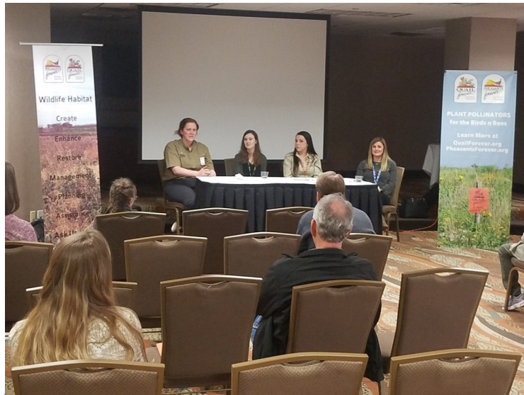
This photo was taken during the Women in Ag and the Outdoor Panel at the 2019 OK PF/QF State Convention.