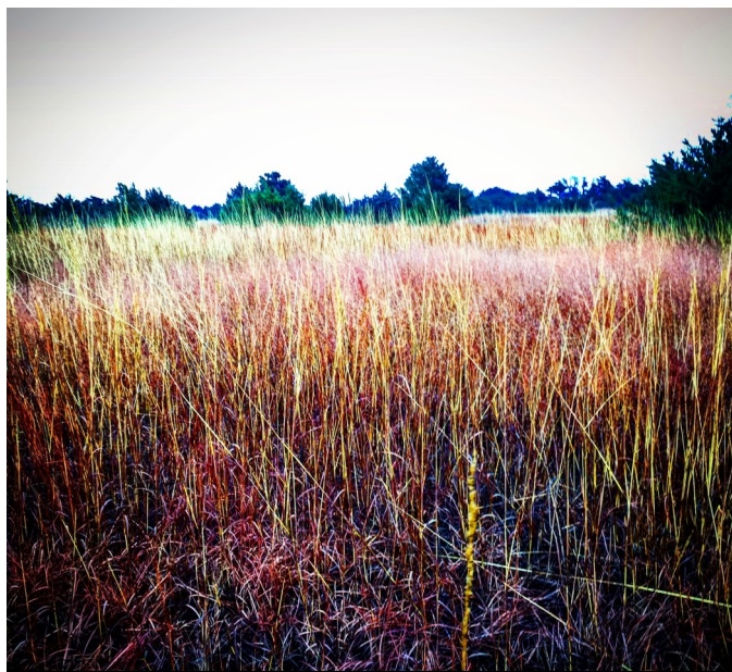
This photo was taken in February, while conducting Cedar-canopy inventories for EQIP and EQIP Monarch applications. Controlling encroaching Eastern Red Cedar is critical to maintaining and/or restoring our native prairie communities