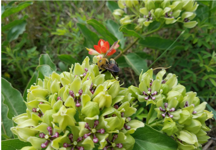
Photo: Carpenter bee nectaring on green antelope horn milkweed. This was also my cover slide for several presentations this quarter!