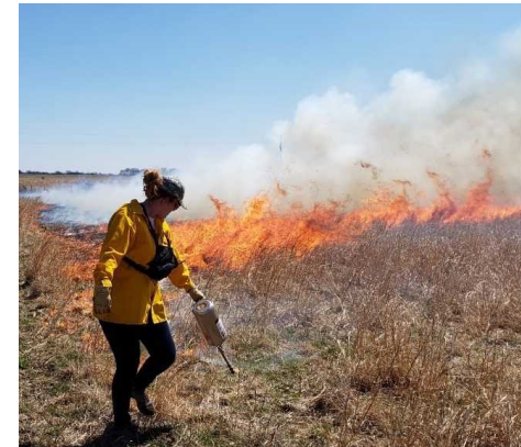
Helping to conduct a burn in Vinita County

This March was the 4th Annual Oklahoma PF/QF State Habitat Convention in Oklahoma City. What a crazy, busy, amazing weekend it was. I got to meet people from around the state that share a common love for quail and conservation. At the convention I moderated and participated in a Women in Ag and the Outdoors panel.