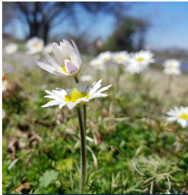
Photo: Carolina anemone ( Anemone caroliniana ), one of the first native species to bloom in the spring!

Another big highlight from this past quarter was Pheasants and Quail Forever Staff in Oklahoma held their 4th Annual State Habitat Meeting in Oklahoma City. This was the 2nd year Oklahoma has split from Texas to host their very own event and it was one for the record books. This years State Meeting set all-time attendance records for all parts of the meeting. Thanks to everyone who attended and made this the best meeting to date. There were great speakers, food, entertainment and attendees walked away with a quarter pound of pollinator seed.