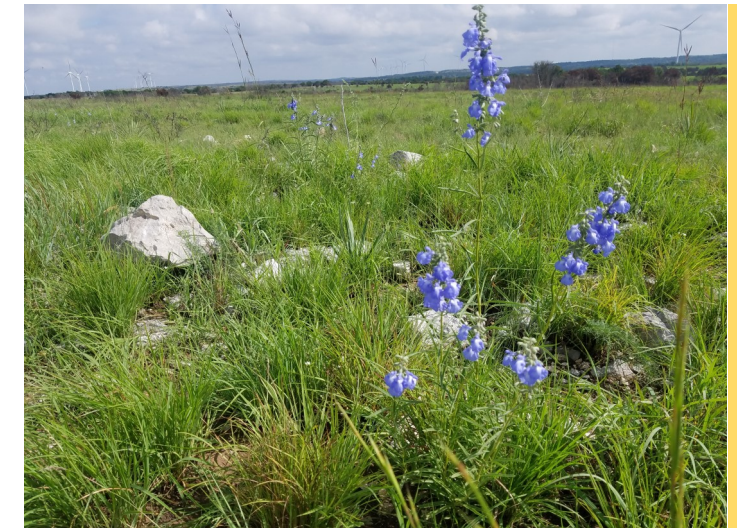
Photo from attending the Great Plains Fire Summit in Ardmore, OK in early October. This particular area was burned the previous spring and is clearly showing the benefits; flowering plants expressing themselves and great livestock forage. You can identify the blue sage in the foreground, but there are many more flowers in the background along with some woody skeletons.