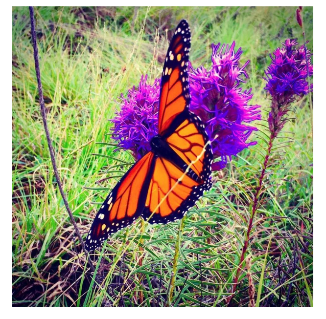
I observed this Monarch feeding on Tall Blazing Star while conducting quail habitat surveys.

With that in mind, each project takes precise planning, implementation, and constant evaluation to provide and maintain high guality habitat and management. In the first couple months since my hiring, I have already begun providing landowners technical assistance for those exact stages of wildlife habitat conservation. Whether it is establishing a watering source, conducting grazing plan evaluations, monitoring a CRP field during midcontract management, these projects all go through the conservation planning process. This quarter, I have conducted several site visits with landowners to discuss possible plans, assisted with grazing plan plant species inventories, as well as meeting with landowners to discuss ways to make their properties both cattle and wildlife friendly. As winter turns to spring, more prescribed fire will be put on the ground to enhance habitats across the landscape.