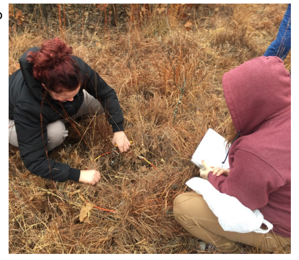
This photo is from the field of an Osage County, OK producer. We were conducting a dry weight rank for a Rangeland Health Evaluation.

It has been wonderful getting out in the field to train and explore Northeastern Oklahoma. It's always a great day when I get to see a White-tailed Deer or turkey wandering through the same trees I'm standing in. My favorite day so far has to be doing tree identification in December using bark as the main determining characteristic. I'm looking forward to working with everyone to incorporate wildlife into their projects!