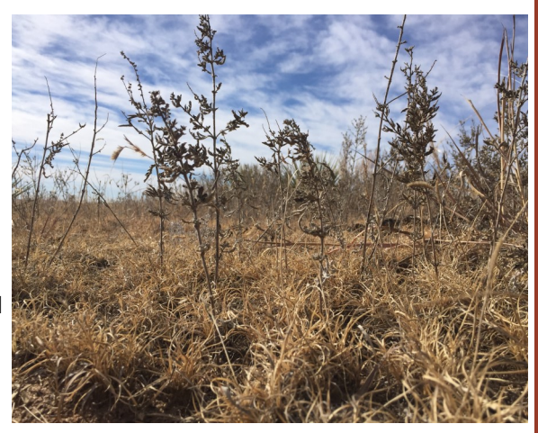
Gaining a quail's perspective while conducting a Range Health Assessment.

A common thread to all the conferences, trainings and meetings I attended this quarter was heterogeneity. Although a foundational concept for natural resources, managing for heterogeneity sometimes gets lost in the details of conservation planning. On all of my site visits and discussion with field staff, I stressed the point that there are lots of little things we can do to make a big difference in the heterogeneity to benefit habitat. I am looking forward to working with them to add more diversity to the contracts by including more species diversity in seed mixes, and disturbances such as brush management or prescribed fire.