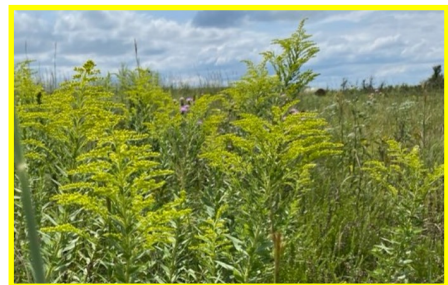
Some plants much maligned by people are favorites of quail and monarch butterflies.