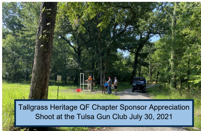
Tallgrass Heritage QF Chapter Sponsor Appreciation Shoot at the Tulsa Gun Club July 30, 2021

It was amazing to see months of planning and preparations come together! It was a great to speak with all the landowners and chapter members from around the state and our partner biologists with ODWC! I had a fantastic day with everyone!