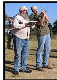
Hands-on plant ID at the QF Field Day (Thanks to all our partners who made it a success!)