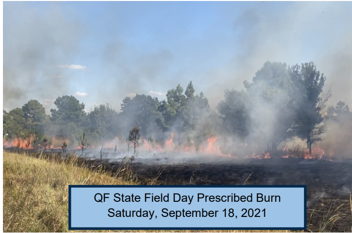
QF State Field Day Prescribed Burn Saturday, September 18, 2021

On September 18, Oklahoma Quail Forever hosted our first State Field Day at Carl Blackwell Lake outside of Stillwater, OK. The day was made possible with our amazing partners OK State Extension and the OK Department of Wildlife. During the morning session attendees had the opportunity to learn about managing habitat for Bobwhites in rangelands and the cross timbers. And learn about potential problem plants and how to address them on their property. In the afternoon everyone had the chance to participate in or watch a 5-acre prescribed burn training. Attendees learned about prescribed burn planning, weather parameters, equipment, and more during the pre-burn meeting. Then those who choose got to go with a burn crew. The day was a great way to get people out into the field where they got to see different management practices first hand. Specially getting people out that have not had the opportunity to help on a burn before.