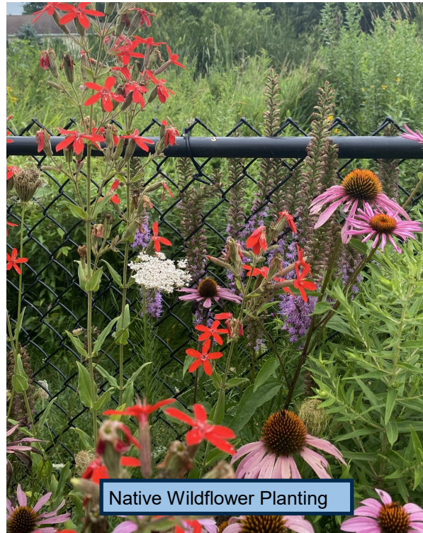
Native Wildflower Planting

It is hard to believe that it has been nearly three years since I start working for Oklahoma Quail Forever and it has been an amazing adventure. This will be my last quarterly report for QF. I have accepted a position as a Natural Resources Specialist with the Natural Resources Conservation Service (NRCS) in Virginia.