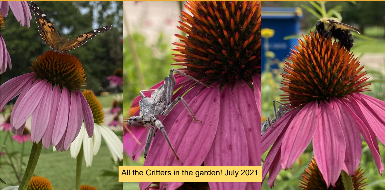
All the Critters in the garden! July 2021