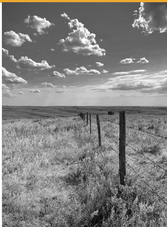
Overlooking a large expanse of land while conducting CRP Grasslands assessments. Many places in No Man's Land remain unchanged.

CRP Grasslands in Oklahoma has become increasingly popular this year, with over 500 applications for over 200,000ac in northwest/Panhandle alone! We are still plugging away at assessments, and hope to finish up the first week of October. Many folks are already chomping at the bit for burn plans for the spring, as well as EQIP applications for cedar removal. We are gaining traction out here, as more producers are wanting to get on board to make a difference. It has been a challenging, but very rewarding road, but the more traction we get, the bigger impact we will make.