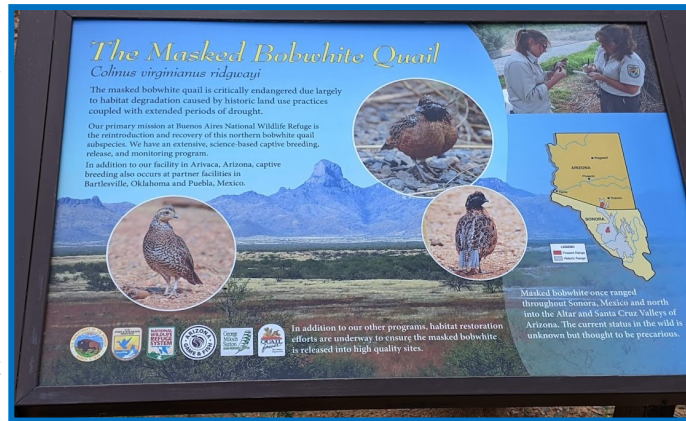
A sign to educate the public about the Masked Bobwhite release program and its important mission. (QF is a proud partner)

As a long-time birder, this was a very long-awaited trip. Southeast Arizona is a birding hotspot, and we hit it at just the right time. Not only did I get to see “the other bobwhite” in its native range, but I racked up 12 life birds in one trip!