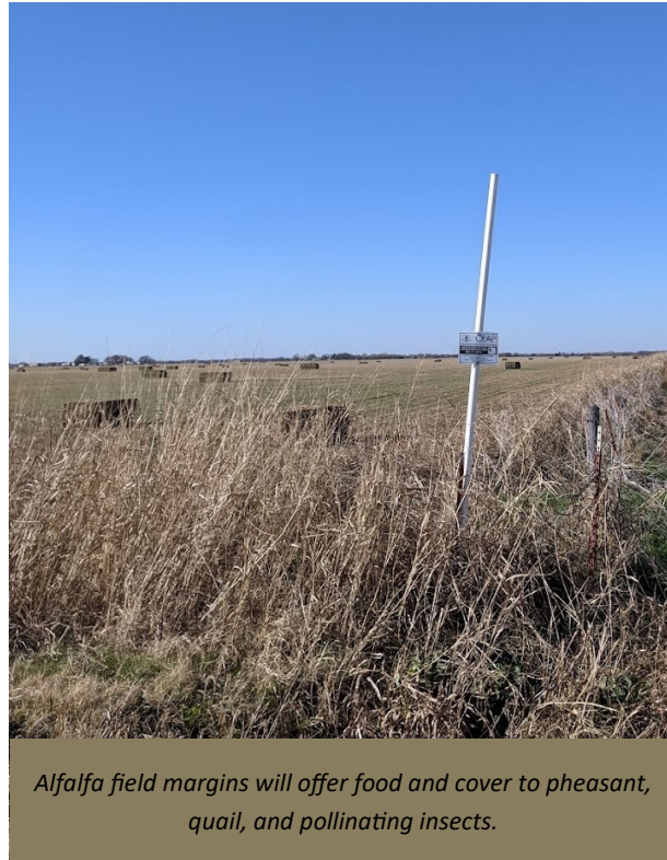
Alfalfa field margins will offer food and cover to pheasant, quail, and pollinating insects.

The hope is that ultimately the producer will see that small changes in his production routine can be enormously beneficial for wildlife.