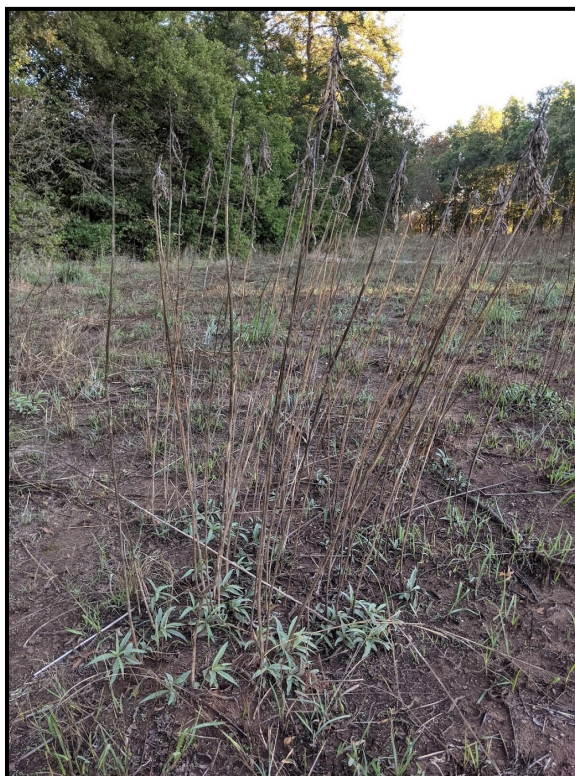
Fire knocks back old growth and removes ground litter, making movement through the area easier for wildlife. Following an August burn, this Maximilian Sunflower is coming back strong! It will attract bugs that quail chicks need for growth in the spring and produce protein-rich seeds that quail and other birds will eat next fall. Plus, it is a favorite nectar source of monarch butterflies. #MonarchMonday.