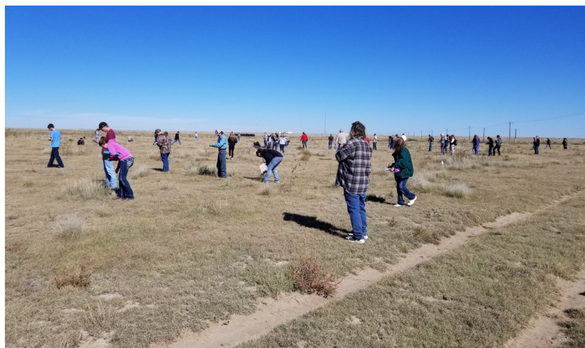
Assisting with Range and Wildlife judging contest.

I also conducted a pollinator outreach through the Pheasants Forever Youth Pollinator Project for 85 second graders, with assistance from CPW and NRCS.