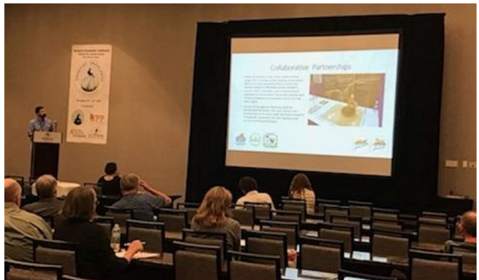
Giving a presentation on LPCI at American Grasslands Conference in Fort Worth, TX.

I have had the opportunity to certify some LPCI EQIP contracts this quarter for 645-Upland Wildlife Habitat management, which involves a variety of different activities ranging from Plant ID, Quail call counts, wildlife escape ramps, fence markers and wildlife guzzlers as a few examples.