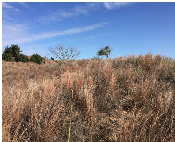
Monarch habitat evaluation in Woods Co. Oklahoma.