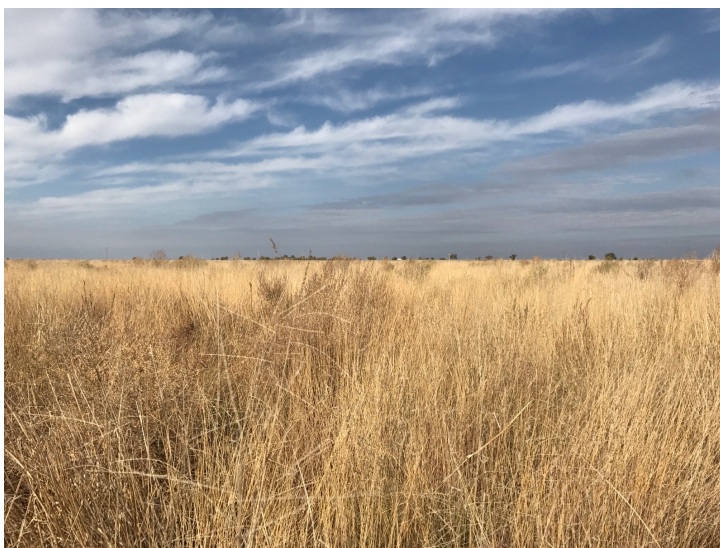
CRP Field check in Roosevelt county, NM