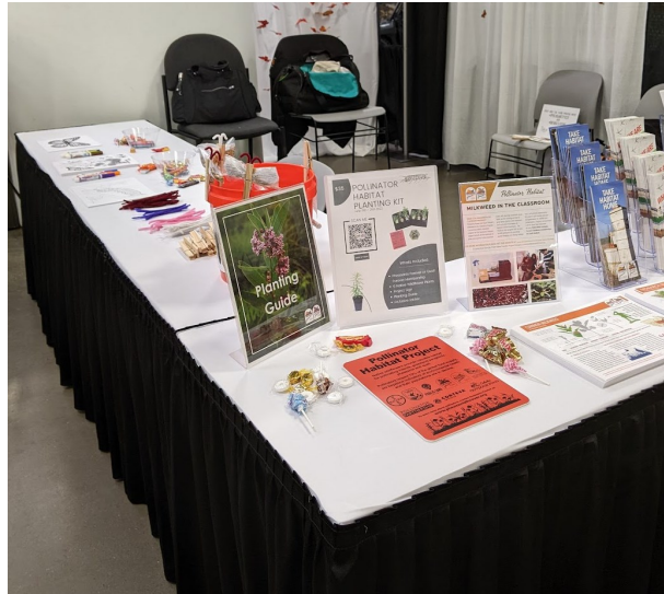
The Pollinator Pathways booth prior to the arrival of more than 33,000 attendees.