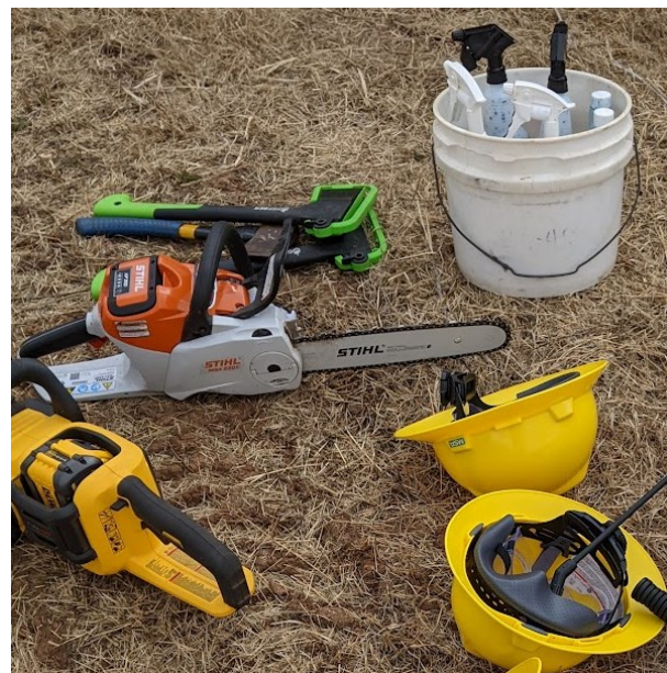
Tools of the FSI trade