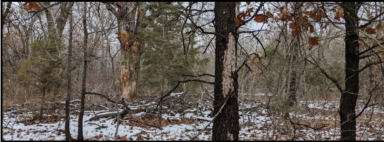
This scene demonstrates the many concerns that arise when forest management is neglected: severely diseased trees, no herbaceous understory, no cover for wildlife, and cedar encroachment.