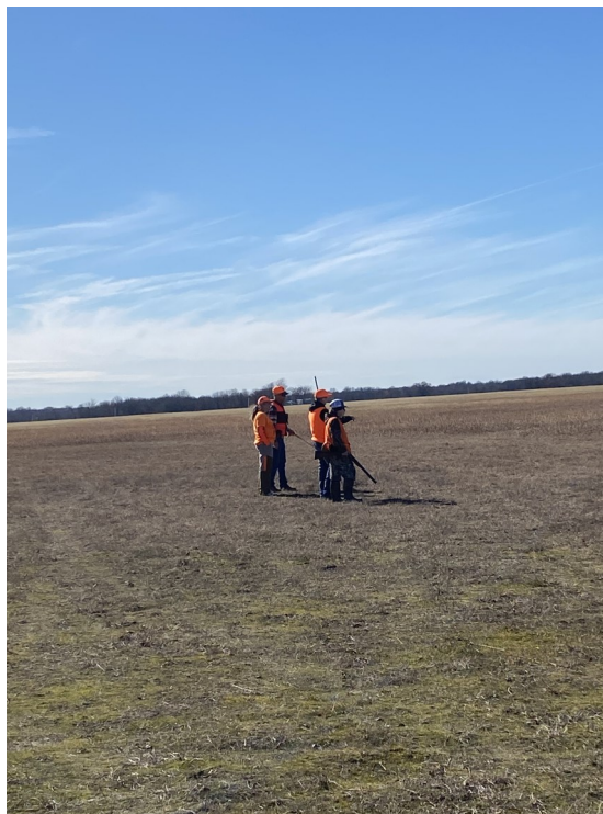
This photo was taken at the Indian Territory and Tall Grass Heritage QF Youth mentor hunt day at the Tulsa Bird Dog club trial grounds.