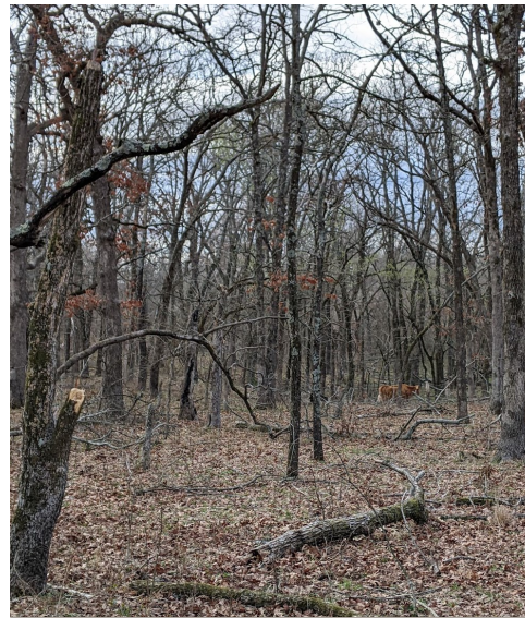
Hack-and-squirt and prescribed fire were used in 2020 to improve the health of this oak forest and increase grazable acres. Several trees still standing are dead and canopy closure is much reduced.

I am most encouraged by the producers' desire and willingness to tackle multi-year, multi-faceted habitat work. The plans were complex, but scheduled in a way to suit their schedule and help them achieve their natural resource objectives.