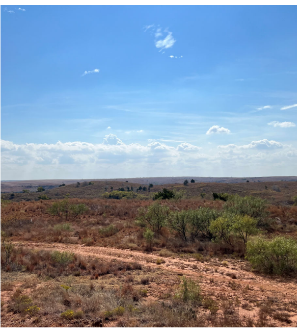
A GPGI prospective property along the Kansas line, across the state line on the OK line.