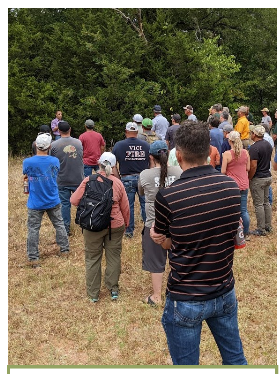
Prescribed Fire Field Day at Lexington WMA