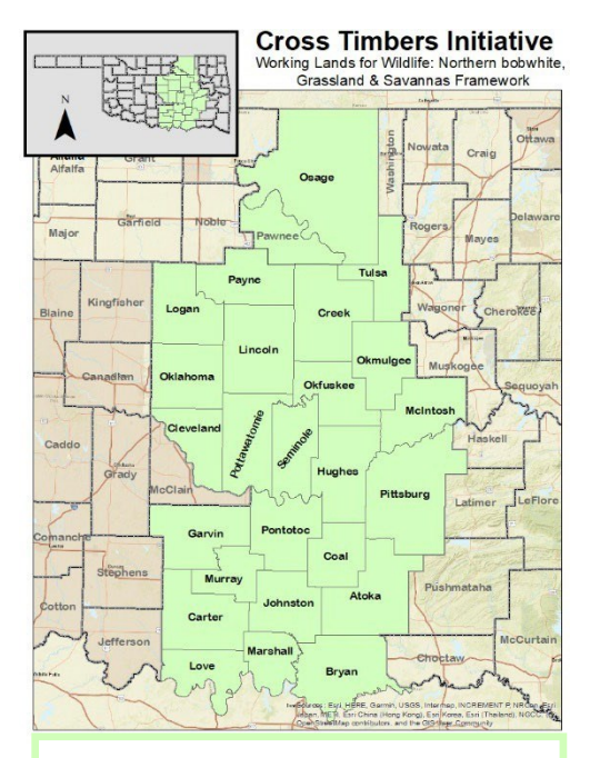
The Cross Timbers Initiative is available in 26 counties throughout east-central Oklahoma