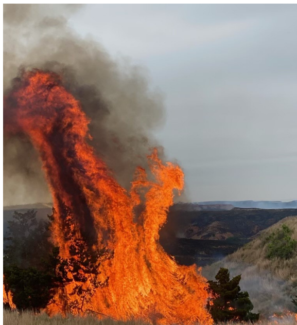
This is an example of GPGI at work. Part of a +/-3,000ac prescribed fire in Woods County.

Once again there was no shortage of opportunity, especially with the new Great Plains Grassland Initiative. The producers are very excited about the addition of this program at I look forward to seeing more of how this will evolve on the landscape over the next several rounds.