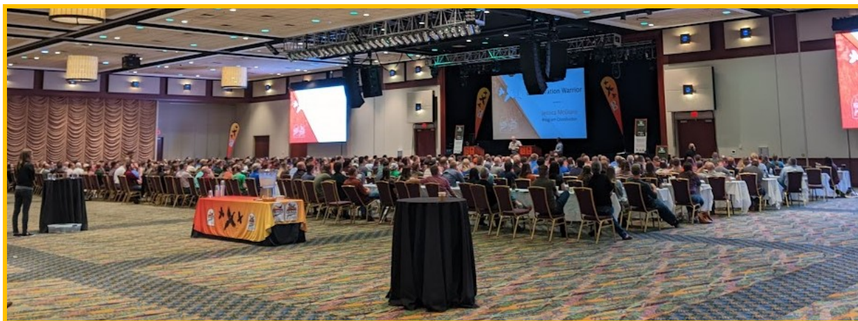
Over 450 PF & QF employees from around the country gathered together for the first time in three years.