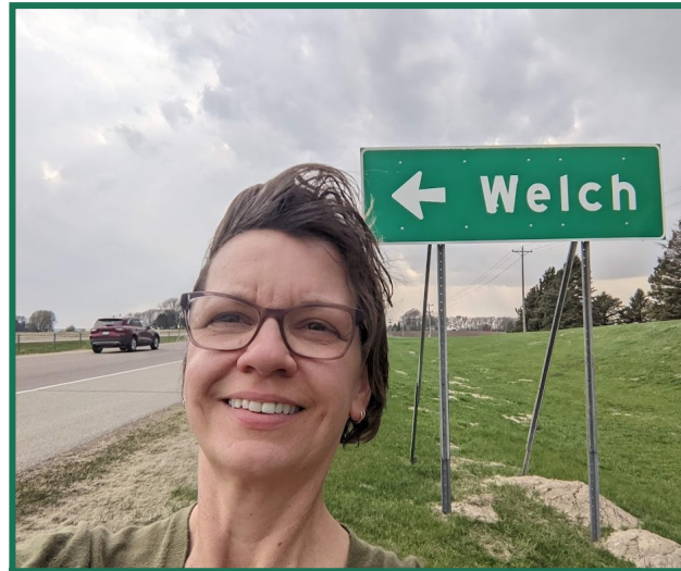
I snapped this roadside selfie near a Minnesota town that shares my maiden name.

In addition to receiving training, I have been able to provide training to new NRCS staff in my area. The time spent together allowed discussion of conservation practices for wildlife as well as how partners can assist field office staff—and how eager we are to do so.